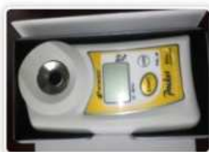
Refractometer, Atago, Japan