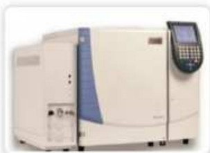
Gas Chromatograph Trace 1110, ThermoFisher