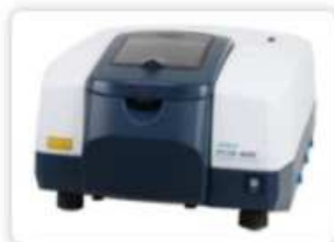
FTIR Spectrometer 4600, Jasco, Japan