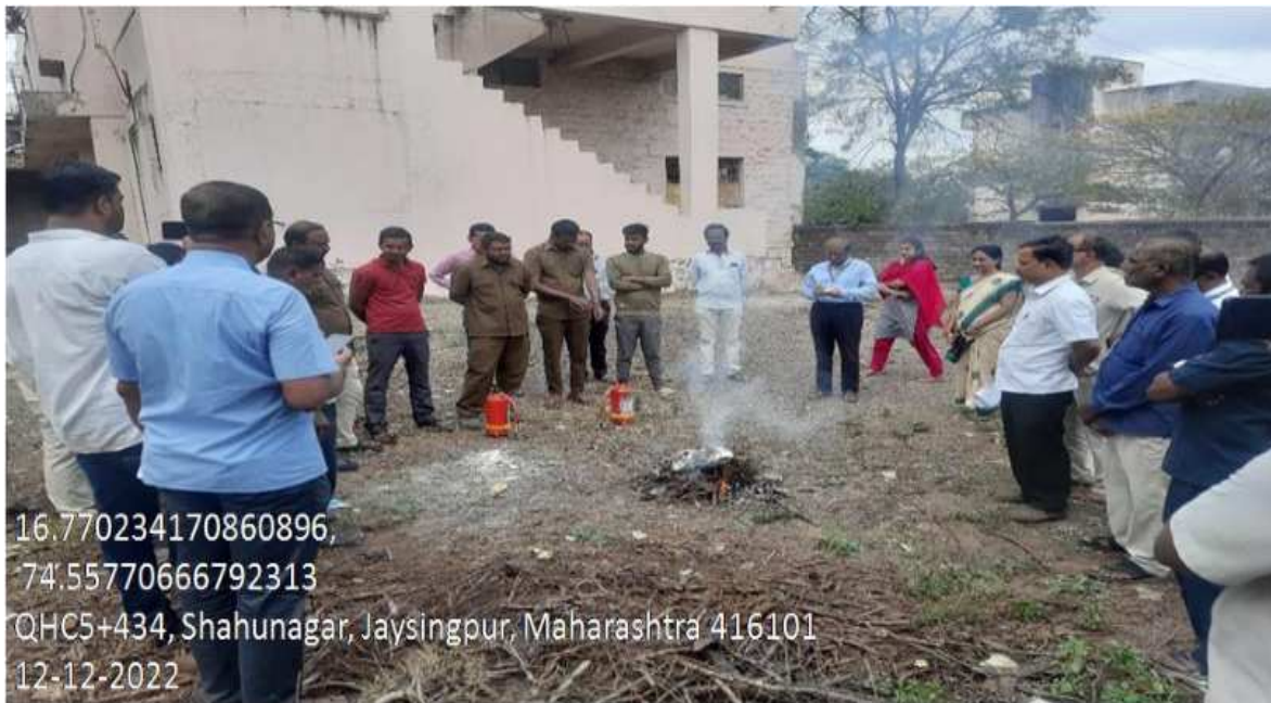
Glimpse of One Day Workshop on Laboratory Safety Workshop