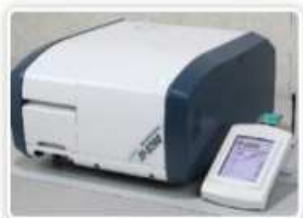
Spectrofluorometer FP8200, Jasco, Japan