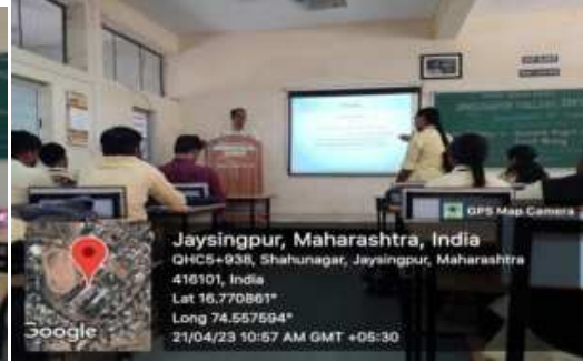
Interaction with Student