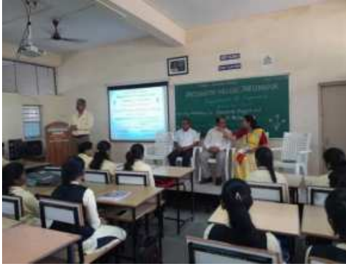
Introductio of programme