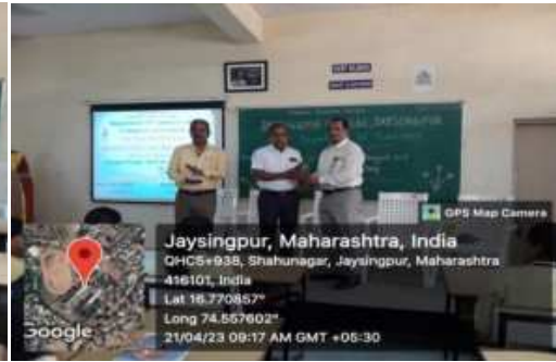
Welcome of Guest